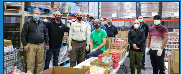
Volunteers assemble non-perishable food boxes at our warehouse on Portage Street in Kalamazoo.

We try to accommodate requests, but again, our opportunities fill up fast! If you would like to help, but we do not currently have any open spots, consider hosting a food drive at your business, church, or neighborhood. With the cancellation of the National Association of Letter Carriers' Food Drive typically held each May, our food donations are much lower than normal for this time of year.