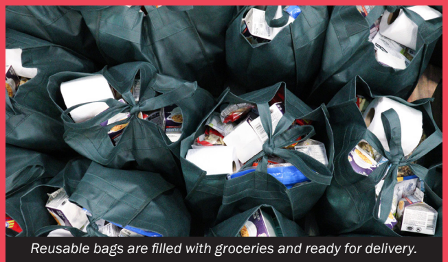
Reusable bags are filled with groceries and ready for delivery.