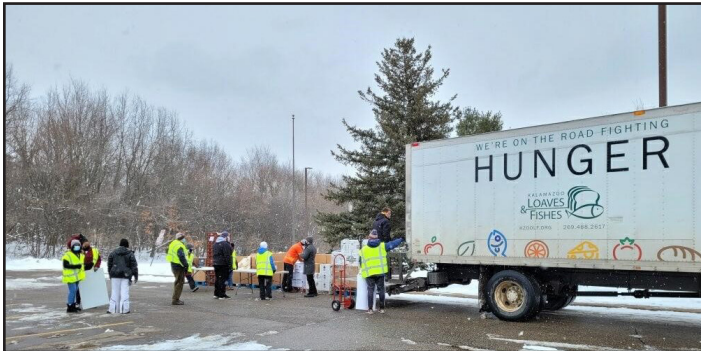
Volunteers set-up for a mobile food distribution at Phoenix High School.

With Kalamazoo Public Schools operating on a virtual model, our 12 school-based pantries have been closed since last March. Since that time, we've worked closely with Communities in Schools of Kalamazoo (CIS) to figure out alternative ways of supporting families with food insecurity. Several CIS Coordinators have frequently picked up food orders and delivered them to families. CIS and personnel from different Kalamazoo County schools have helped spread the word about KLF programs to their students and families. Yet, we felt we could do more. So we took the show on the road! Since November we've been rotating Mobile Food Distributions at school buildings throughout the county. Distributions have occurred at Kalamazoo Central HS, Loy Norrix HS, Phoenix HS, Comstock HS, Linden Grove MS, Spring Valley Elementary, Prairie Ridge Elementary, and Lincoln Elementary. These extra distributions have proven to be excellent outreach events by providing both food and information to families who hadn't visited KLF prior. We plan to continue these school distributions through the summer and will re-evaluate for the 2021-2022 school year. Once scheduled, school distributions are posted on our Facebook page and kzoolf.org.